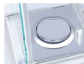
Ergonomic weighing pan design